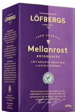
Figure 4 Löfbergs

ZOEGA's main markets are Sweden and Scandinavia, where product development is tailored to local consumer tastes and preferences. It's famous for dark roast coffee. It's worth mentioning that ZOEGA launched Coffee for Women, a sustainable coffee program in Kenya, Rwanda, and Uganda to make coffee production more profitable and inclusive. 17