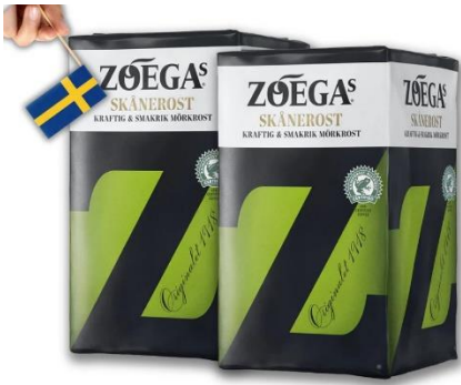
Figure 3 ZOEGA

ARIVID NORDQUIST is known for using high-quality Arabica coffee beans, which are grown by certified farmers, and ensuring consistent quality and taste in every batch. Also they work actively to reduce the emissions and impact on the environment, they compensate for the carbon emissions they haven't yet managed to tackle through tree-planting schemes in coffee-growing countries. 16