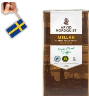
Figure 2 ARIVD NORDQUIST

Figure 1 is our positioning map, comparing to three other Swedish brands, TGC coffee can take into account convenience and high quality. TGC coffee uses an intelligent system, such as field monitoring and agricultural production record, agricultural product processing record system to detect and ensure the quality of coffee beans. In Figure 1, other Swedish brands have their own product characteristics. However, local coffee brands in Sweden rarely have drip bag coffee, and most of them are in the form of coffee beans. 15